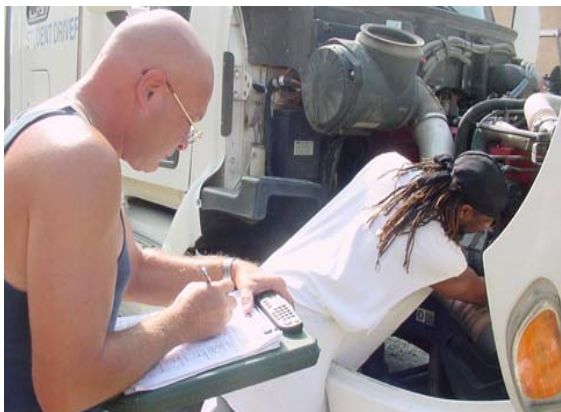
Students learn the steps of pre-trip inspection in preparation for their DMV exam.

The Truck Driver Training program at BCCC is offered through the Division of Continuing Education. This course is a combination of classroom and off-road track instruction as well as over-the-road driving practice with an instructor. Classes are designed to prepare students taking the mandatory tests to obtain a Class – A Commercial Driver’s License. The HRD/CRC component allows students to preview job openings and prepare to apply for these positions. Students will also work toward earning a Career Readiness Certificate - which is nationally recognized and enhances job related qualifications.