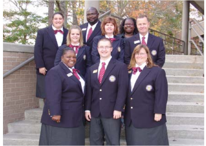
BCCC Ambassadors represent the college in many ways. Pictured above, the 2008-2009 BCCC Ambassadors in their official portrait.

The deadline for faculty nominations for BCCC Ambassadors is April 3. For more information about the Ambassador program, interested persons can contact the BCCC Foundation office at 940-6218.