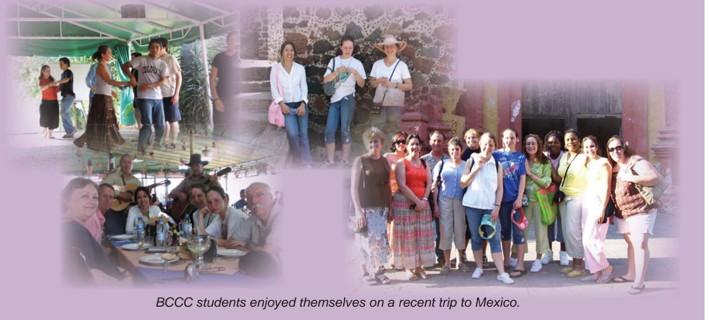
BCCC students enjoyed themselves on a recent trip to Mexico.